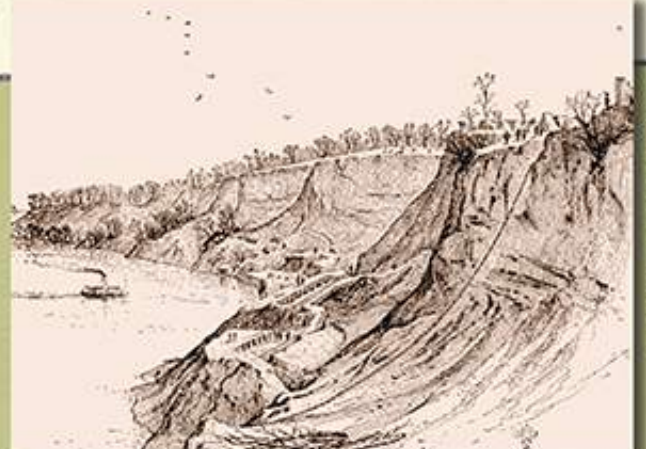
The "Iron Banks" of Kentucky, above Columbus, showing the Confederate fortifications. From a wartime drawing appearing in Battles and Leaders of the Civil War .