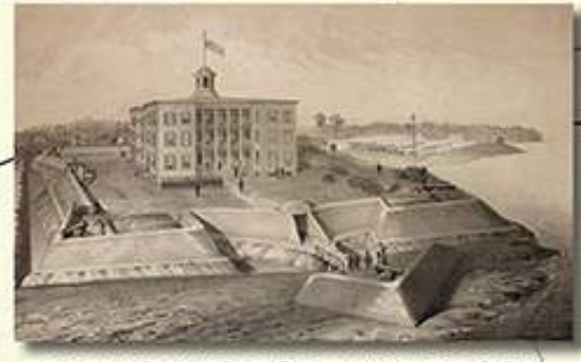
PADUCAH'S FORT ANDERSON