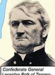
Confederate General Leonidas Polk of Tennessee moved aggressively on Missouri and Kentucky in 1861. He was an ordained Episcopal minister.