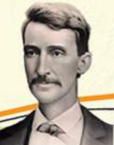
Brig. Gen. M. Jeff Thompson, known as the Missouri Swamp Fox, was Ulysses Grant's nemesis in the Fall of 1861.