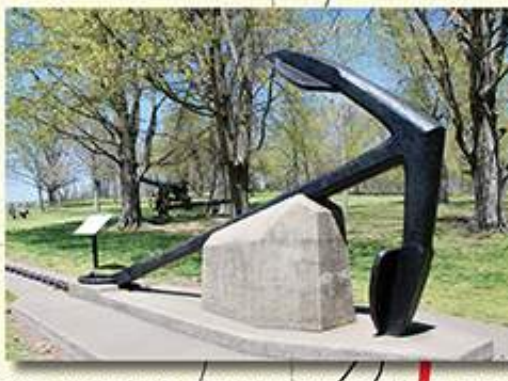
COLUMBUS-BELMONT STATE PARK