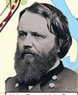
Union General John Pope of Illinois won the Battle of Island No. 10 in April, 1862. Later that year his career was wrecked by a loss in Virginia.