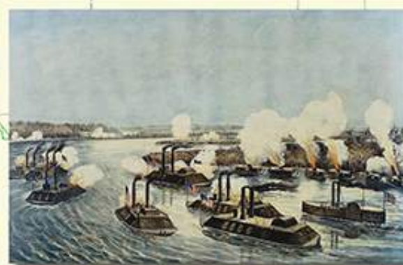
BATTLE OF ISLAND #10